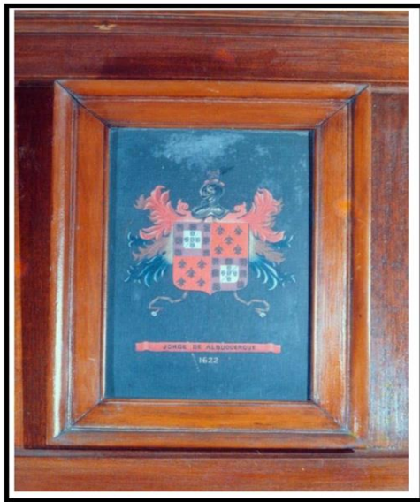
Jorge de Albuquerque (1622)