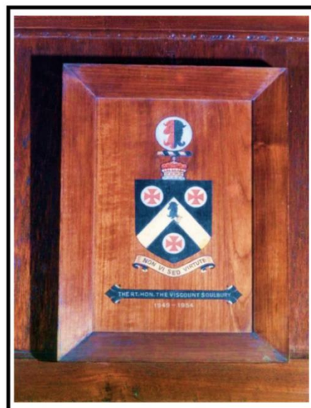
Viscount Soulbury (1949-1954)