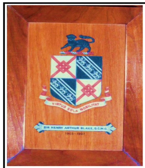
Sir Joseph West Rridgeway (1895)